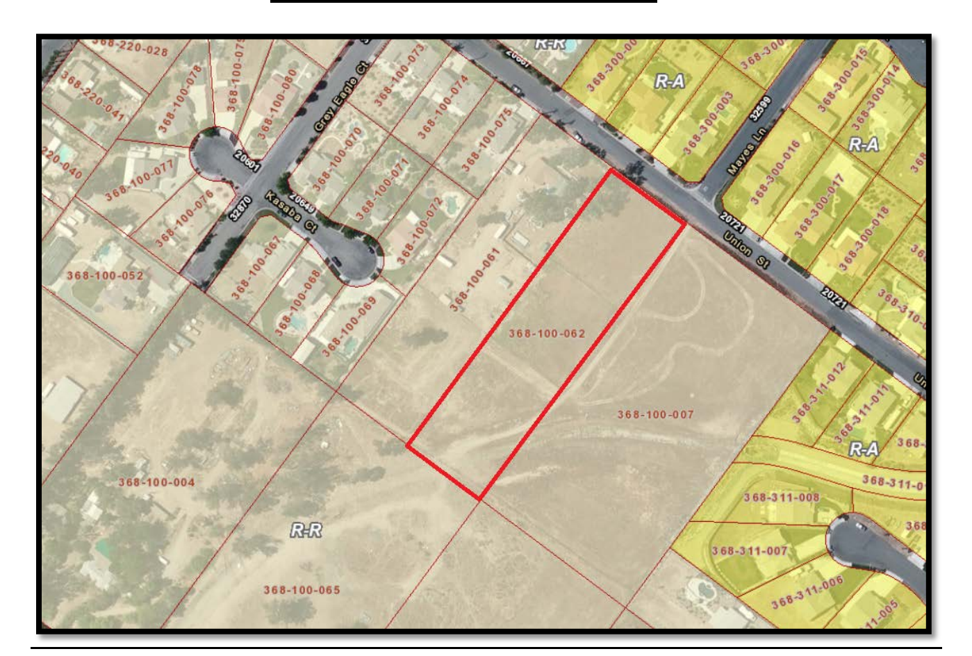
Figure 3. Zoning Designation Exhibit