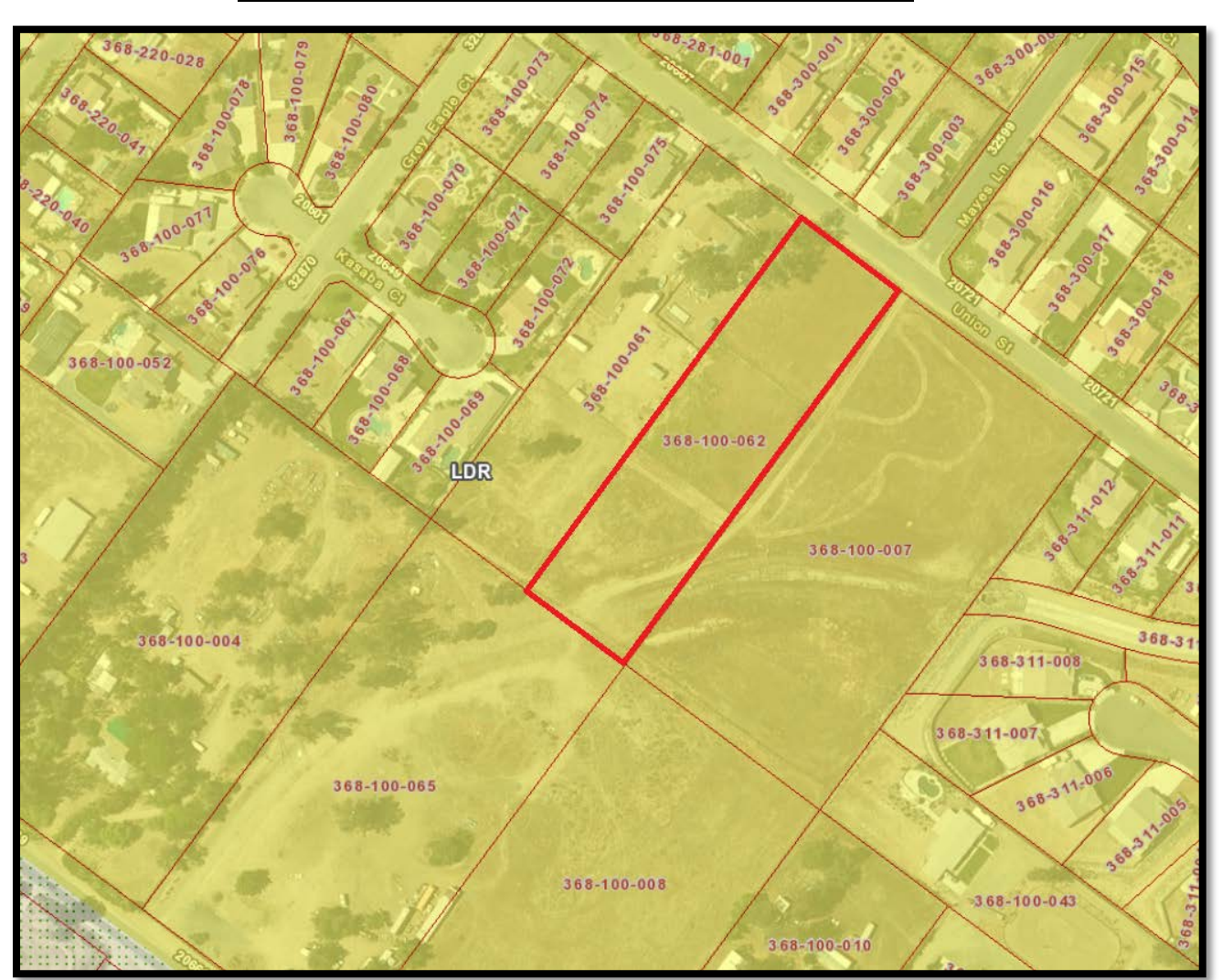
Figure 2. General Plan Existing Land Use Exhibit