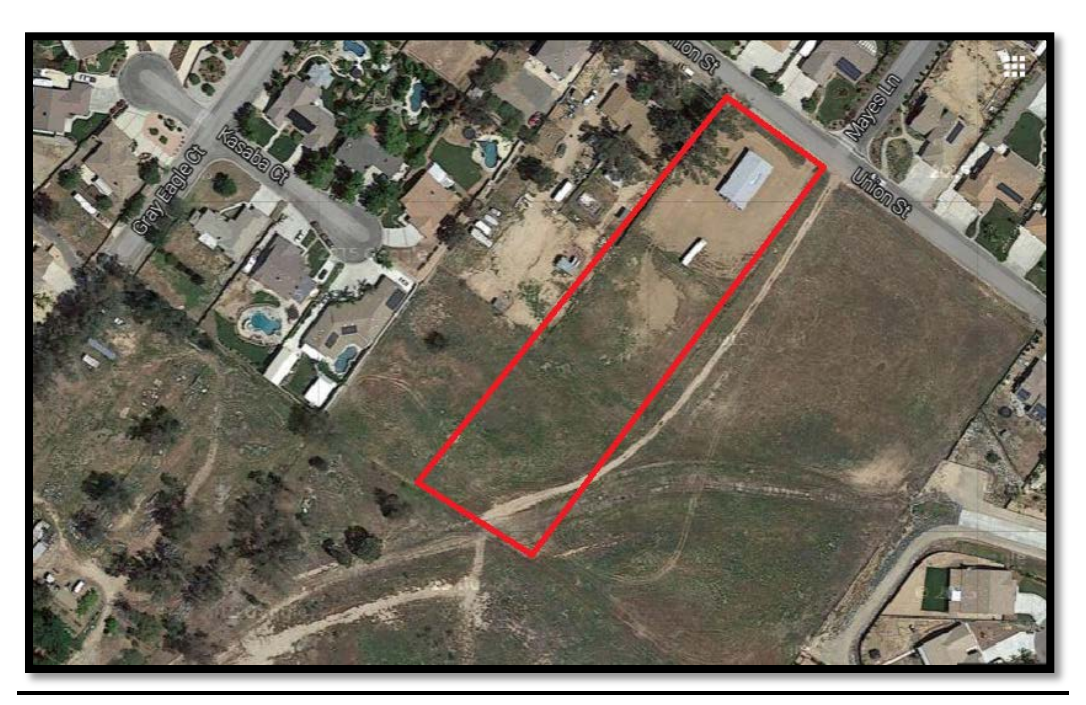
Figure 1. Vicinity/Location Map